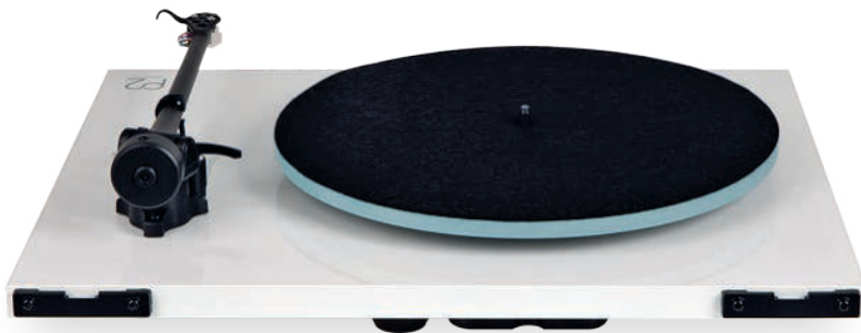
ABOVE: Rega's AC motor is driven by a wall-plug 24V power supply. A fixed pair of phono (RCA) cables exit from the base of the latest RB220 tonearm

of Nu Era's 'Lines Between Us' [from Geometricks EP ; Omniverse OMN11201] showed me that little has changed in terms of the Planar 2's overall balance. The latest deck to carry the name remains smooth but a little dry – it certainly doesn't offer any extra coloration to sweeten the musical pill, and this might disappoint some analogue addicts. Bass is a little light in absolute terms, too, although certainly no worse than price rivals.