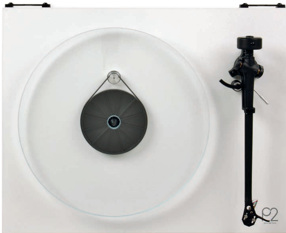
RIGHT: The Planar 2's acrylic-laminated plinth hosts an AC motor mounted at 12 o'clock under a glass platter. Its RB220 tonearm comes fitted with a Rega Carbon MM pick-up

As ever, you change the speed by moving the belt on the pulley even though this means you have to remove the platter. The main bearing is a new 11mm self-securing brass affair, which is said to offer lower friction and a tighter manufacturing